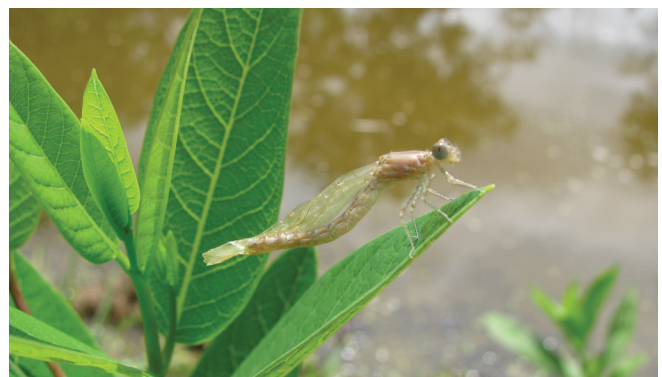
Insect molting damselfly

The presence and diversity of aquatic macroinvertebrates such as mayflies, caddis flies and stone flies indicate improved water quality because many cannot tolerate polluted water. Many also live in the streams year-round and are considered good indicators of year-round water quality, much like the canary in a coal mine. Although all of the stream segments studied remain categorized as “impaired” by the PA Department of Environmental Protection, all five of these sites showed significant improvement in habitat quality as well as the diversity of the macroinvertebrate community. In addition, two projects in the sampling area were completed in the fall of 2024 and winter of 2025, so continued water quality improvements are expected in years to come.