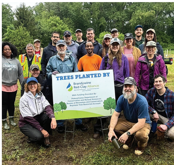
East Hilldendale tree planting

Nearly a month later, 237 volunteers removed 4 tons of trash and 140 tires along 59 miles of stream and roads as part of the Brandywine Valley Clean up that included 12 municipalities in Pennsylvania and New Castle County Delaware. While the amount of trash has been trending down in recent years, 2025 saw an increase in the amount of trash collected.