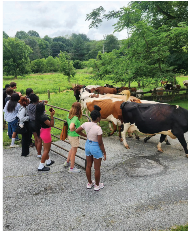
Green jobs at Baily's farm

This summer interns spent three days with BRC visiting agricultural best practices for clean water at Baily's Dairy Farm (including ice cream), learning about dam removal and learning to fish at Brandywine State Park (DE) and the annual canoe trip with Northbrook Canoe. While many important lessons are learned along the way, the experience of catching a fish, petting a cow and swimming in the Brandywine Creek are memories that will last a lifetime.