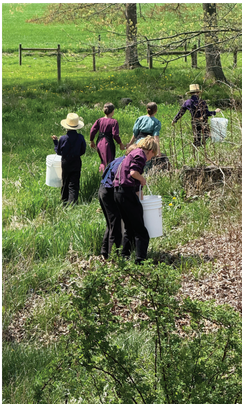
Amish Trout stocking

Thanks to everyone who came and enjoyed this year's Summer Music Series and 15th Annual Dead Fest. We hope that you enjoyed the sweet sounds and delicious food!