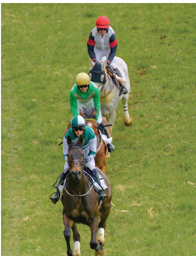
Horses and jockeys head up the hill in the Open Race