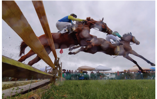
Flying over the last fence