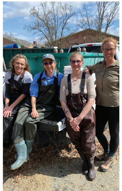
Some of our trout stocking crew.

This year BRC had a busy spring with trout. The annual Trout Rodeo was held in conjunction with Anson B. Nixon Park, and we were also able to stock trout in both Pennsylvania and Delaware locations, including one with our Amish neighbors in western Chester County.