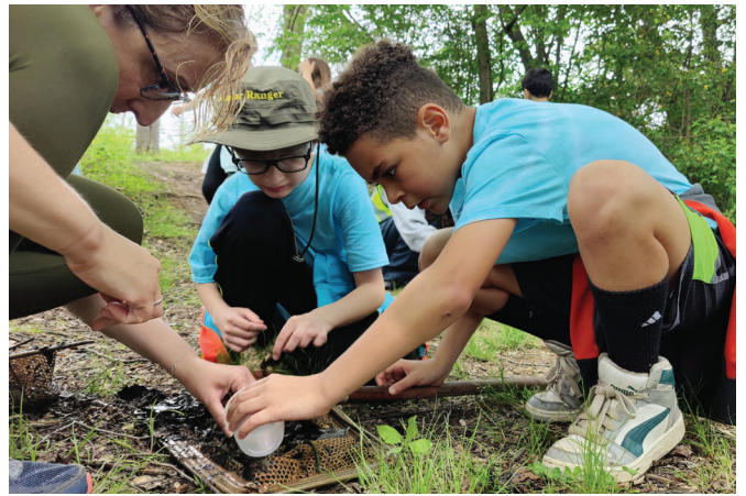
Dipnetting for macroinvertebrates in the pond