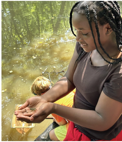
Providing opportunities for disadvantaged youth to get outside and explore nature

We provided over $12,000 in camp scholarships across our three camp locations to allow economically disadvantaged youth to experience the joys of an outdoor summer nature camp. 63% came from the Coatesville community.