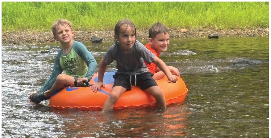
Another wet and muddy day at summer camp!