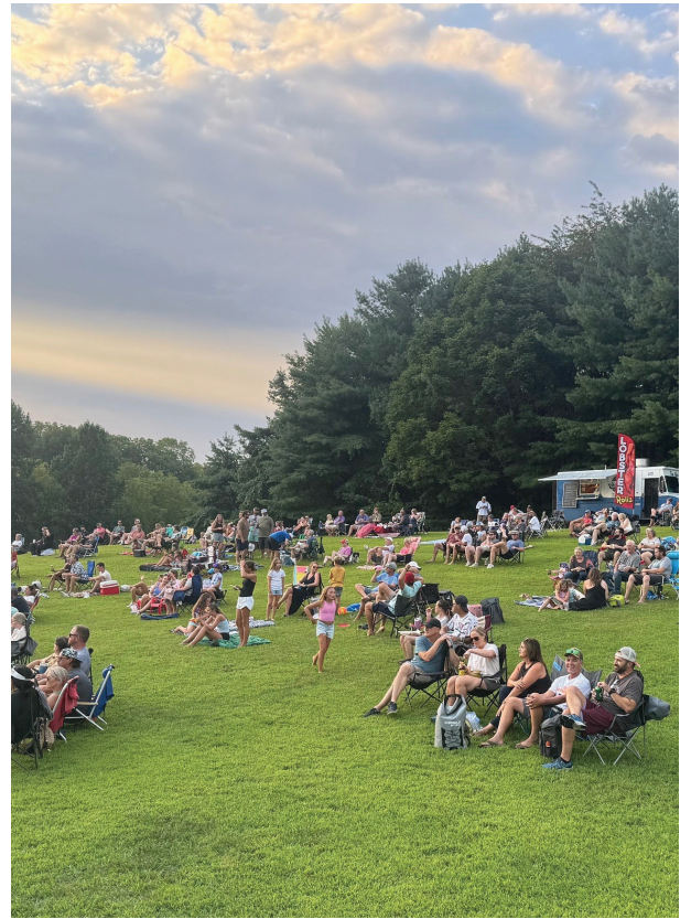
Summer Music Series