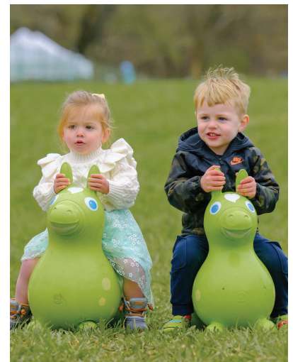
Bouncy Pony Races are just one of the highlights of the day