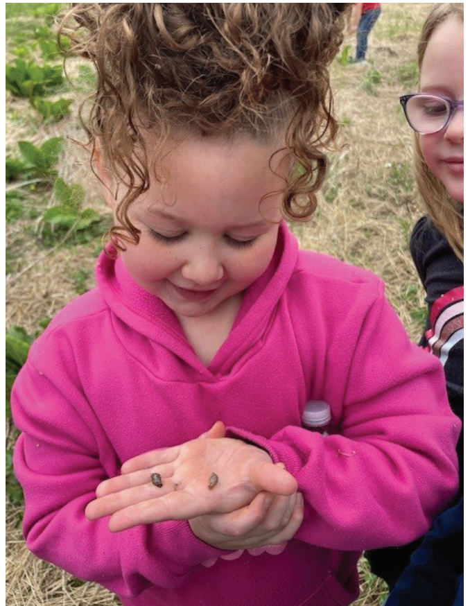
Appreciating nature no matter how small it is