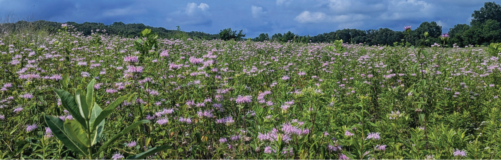
Little Elk Creek Preserve Native Meadow