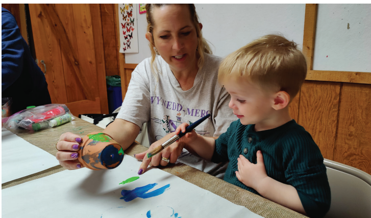
Early education programs