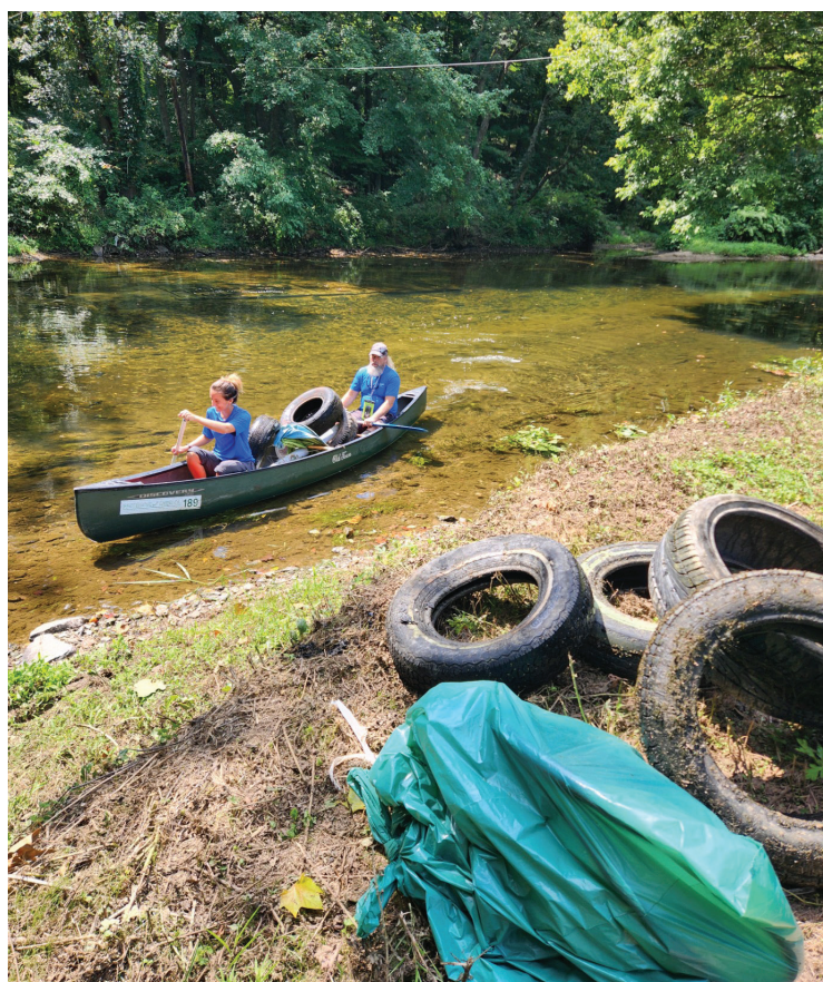
Thanks to Aqua for helping to clean up on the Brandywine!

This is a reminder that litter and illegal dumping remain a problem for our local waterways.