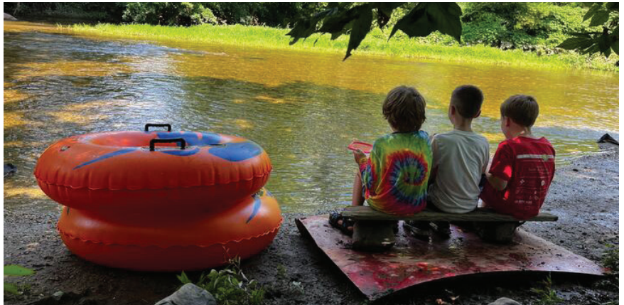
Forging friendships while pulling debris from our waterways