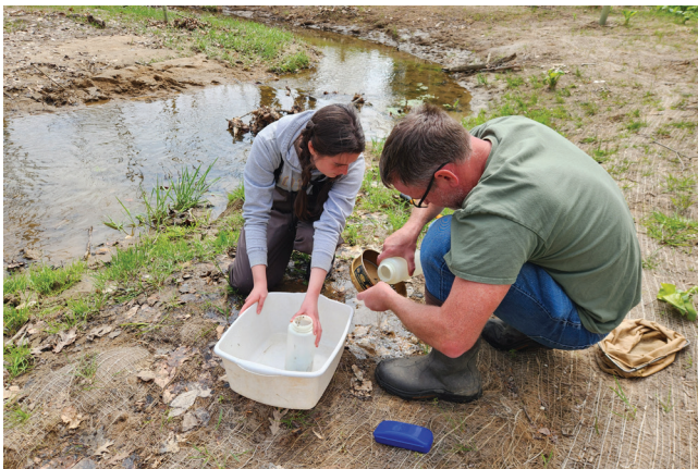
East Branch Red Clay water sampling

In 2010 BRC partnered with Clauser Environmental, LLC to complete a watershed assessment and restoration plan of the Upper East Branch of the Red Clay Creek. As part of the study, we sampled water quality in 2010 before restoration projects were implemented at five sites and found that the number and diversity of macroinvertebrates (insects whose presence indicates good water quality and a healthy food chain) was low, and habitat conditions were poor across the sites.