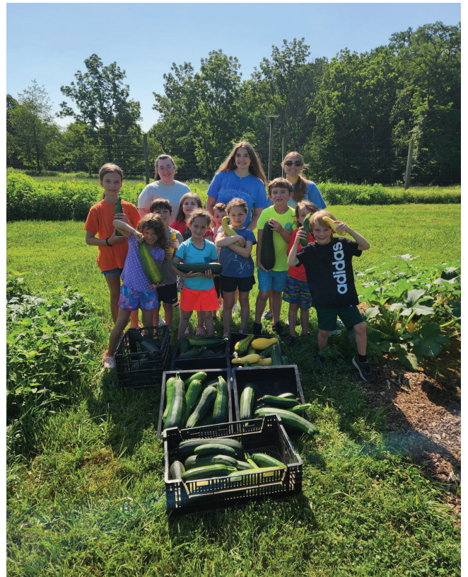
2025 Victory Garden

Since then, we've donated over 6,300 pounds of zucchini, cucumbers, tomatoes, peppers and fruit to the Chester County Food Bank and Kennett Area Food Cupboard. Many thanks to volunteers at Chatham Financial for helping to plant the garden this spring and summer campers for helping with weekly harvests.