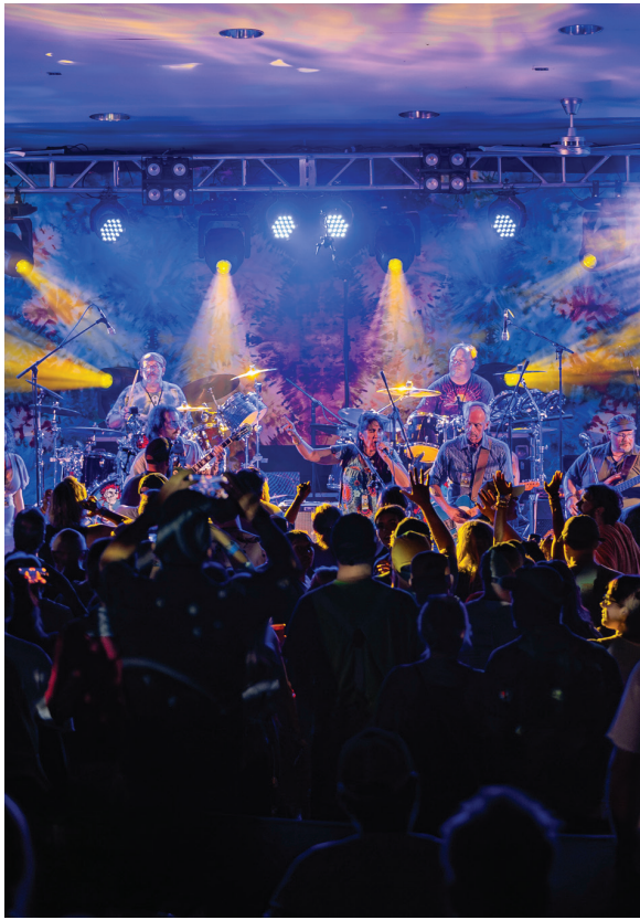
Dead Fest 2025