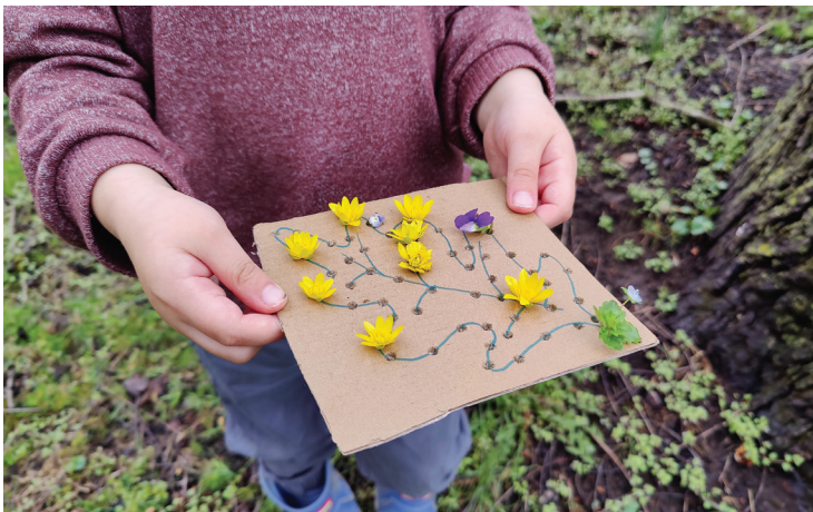
Discovering the relationship between leaves and flowers