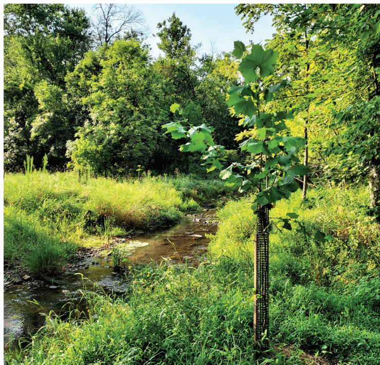
Riparian tree planting at Nixon Park

The other two projects completed 2 of our 7 acre goal as part of a PA DCNR grant to plant new riparian buffers in the Red Clay Creek. Phillips Mushrooms is the site of one acre of new trees planted at the headwaters of a tributary to Red Clay Creek and provided volunteer and site preparation support. Additional funding and volunteer support came from the water utility, Veolia, who understand that riparian buffers provide clean water downstream for their water intake and water customers in Stanton, Delaware.