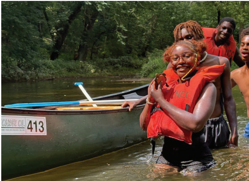
Green jobs canoeing