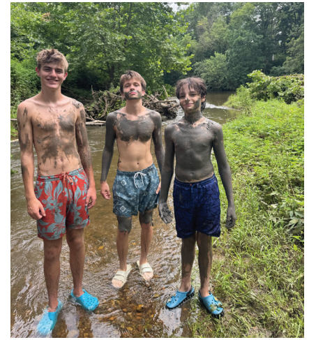
Campers and counselors get Wet & Muddy everyday during camp