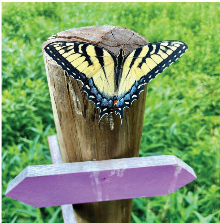
Tiger swallowtail taking a break by the pollinator meadow. Monarch caterpillar in the meadow.