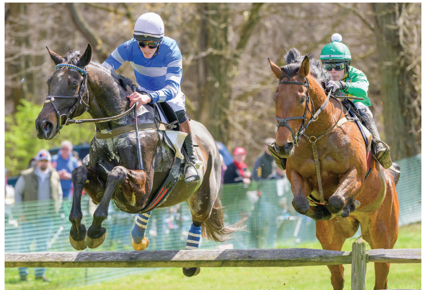
Over the Last Jump.