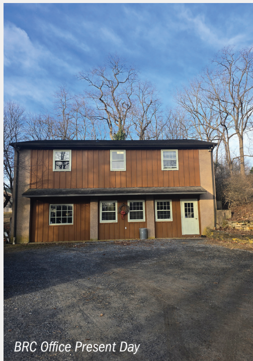
BRC Office Present Day