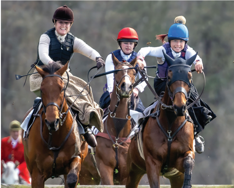
Side Saddle Race Participant over the Last Fence.

Parking costs range from $25 to $350. Sponsorships are available; if interested please contact the BRC Office at 610-793-1090 and speak with Betsy Stefferud.