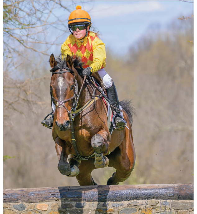
Over the Stone Wall.