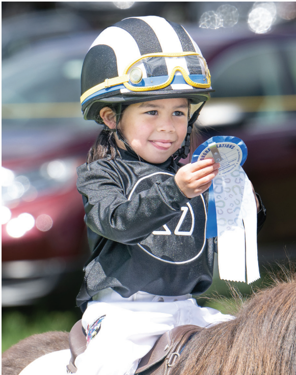
Leadline Pony Race Participant.