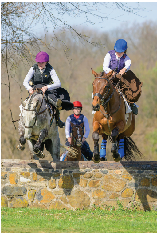
Side Saddle Race Participants

BRC and the Brandywine Hills Point to Point Committee thank all the sponsors, patrons, volunteers, owners, trainers, riders and attendees for making the race meet successful. Proceeds benefit BRC's environmental education and watershed conservation programs.