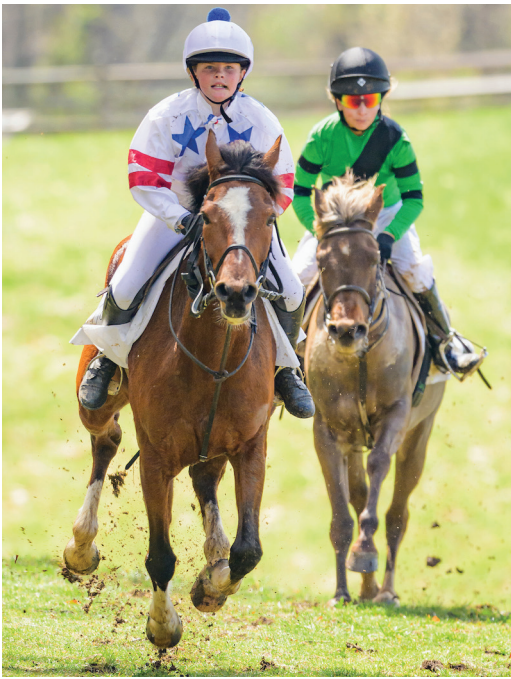
Pony Race Participants