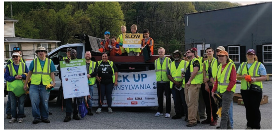
Brandywine Clean Up Volunteers in Modena.

This community effort would not be possible without the generous support of: Cleveland Cliffs, USW #1165, Flyway Excavating, Aqua, Pennsylvania American Water, Victory Brewing Company, Downingtown Municipal Water Authority, Marshallton Conservation Trust, SECCRA and Republic Services.