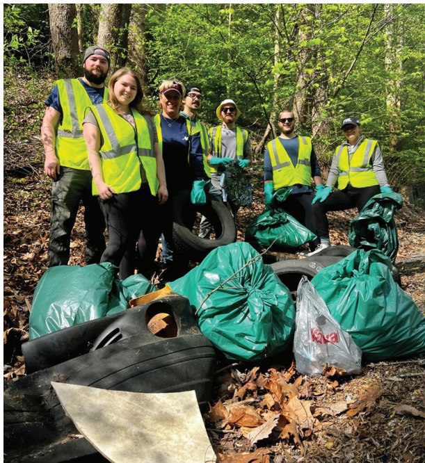
Volunteers from Victory Brewing Company.

Our clean up continues to expand in area covered thanks to our regional site leaders and included four staging areas in two states: Modena, Downingtown, Pocopson/West Chester and Beaver Valley, Delaware and included portions of 11 municipalities. The annual clean up removes trash BEFORE it enters the streams and reduces plastics, tires and other pollutants that have long-term impact on our streams and oceans.