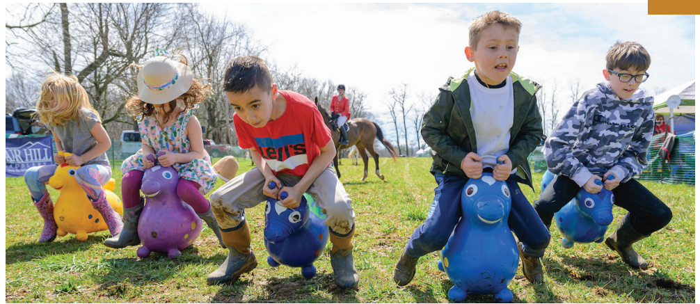
Bouncy Pony Race Participants