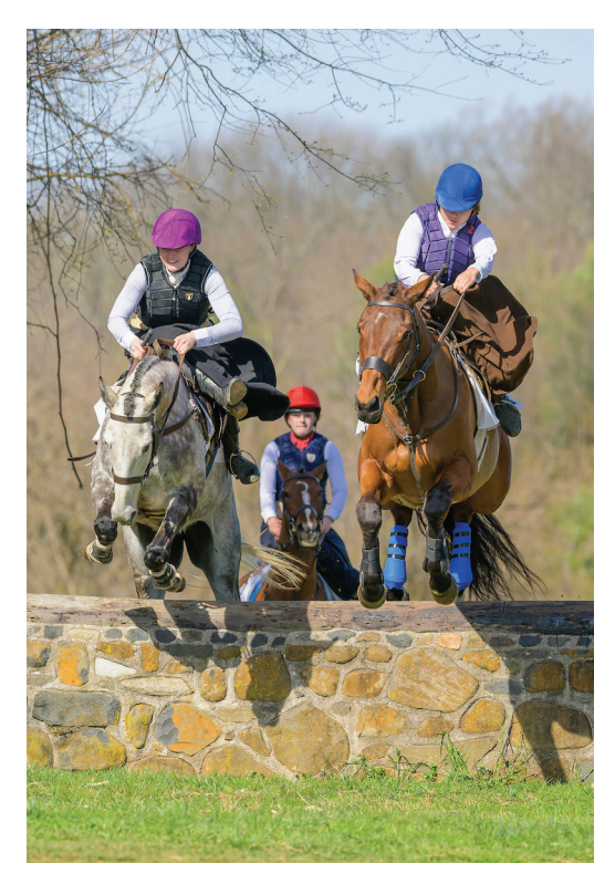
Side Saddle Race Participants