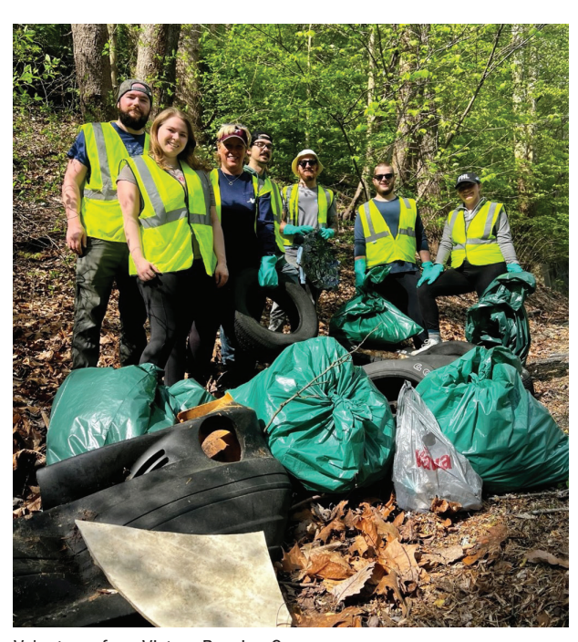
Volunteers from Victory Brewing Company.

Our clean up continues to expand in area covered thanks to our regional site leaders and included four staging areas in two states: Modena, Downingtown, Pocopson/West Chester and Beaver Valley, Delaware and included portions of 11 municipalities. The annual clean up removes trash <a href="mailto:BEFORE">BEFORE</a> it enters the streams and reduces plastics, tires and other pollutants that have long-term impact on our streams and oceans.