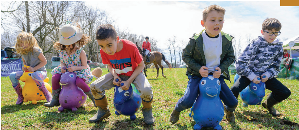
Bouncy Pony Race Participants