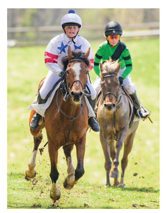
Pony Race Participants