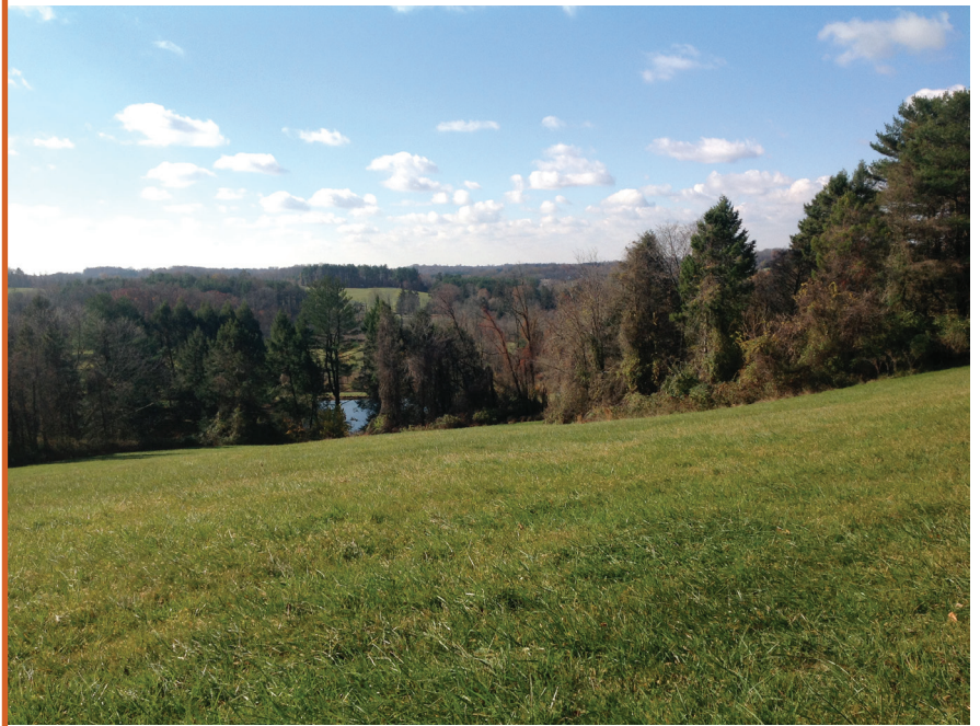
Newly protected open space in the Red Clay Creek watershed.

If interested in preserving your property, please reach out to BRC today!