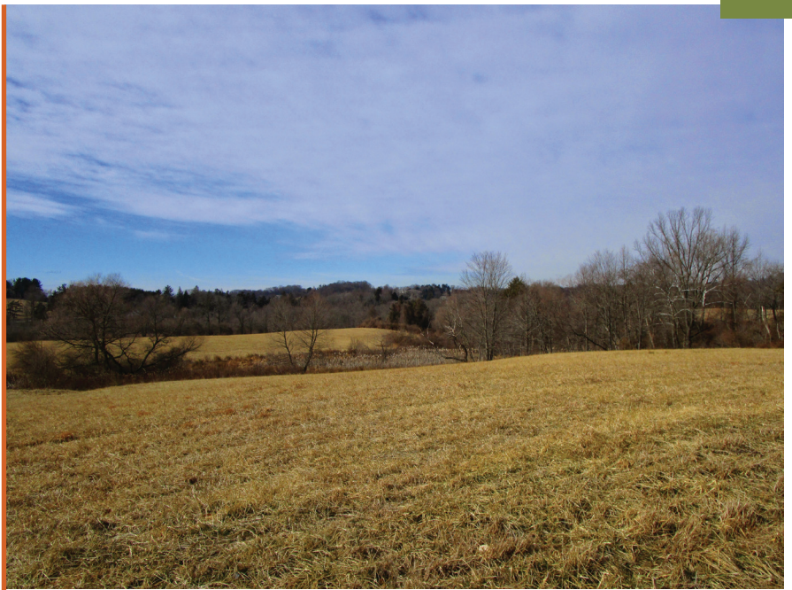
Newly protected open space and wetland habitat in the Red Clay Creek watershed.

Two critical water quality projects were completed on Earth Day that permanently protected 107 acres of land in the Red Clay Creek watershed. The small easement is a fully wooded parcel with a tributary running the length of it; the conservation easement permanently protects the riparian buffer and wetlands that make up the acreage to ensure a shaded, cool stream for fish and wildlife. The larger parcel protects 100 acres of open space by eliminating all future development of the easement area and permanently protecting approximately 25 acres of freshwater wetlands and stream corridors for two first order tributaries to the East Branch Red Clay Creek.