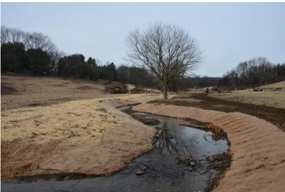
re-graded stream banks in Phase 1