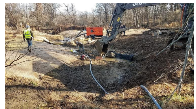
Pumping for excavation in dry stream