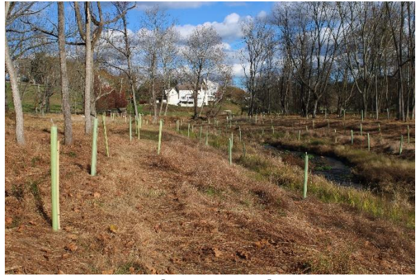
Riparian Tree Planting in Phase 2