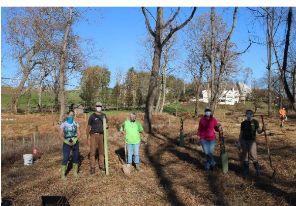
Volunteer tree planting crew