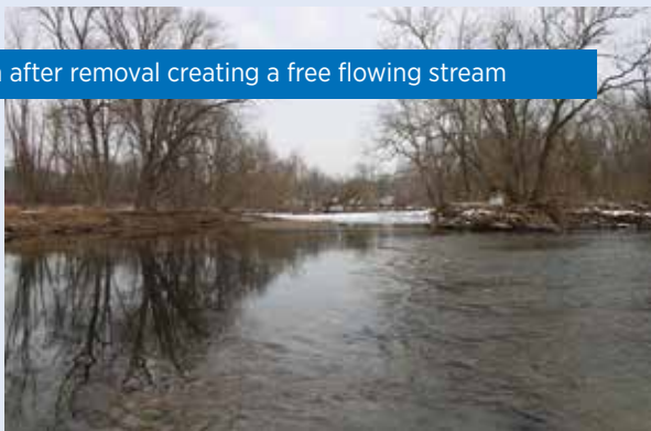
Lenape Dam after removal creating a free flowing stream