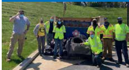
Employees from Pennsylvania American Water cleaned the Coatesville Reservoir and Hibernia Park.

We want to thank our sponsors for supporting this year's clean up: