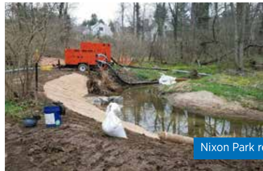
Nixon Park restoration

Phase 1 of this project was completed in March 2021 and construction on Phase 2 is currently in progress. Funding for this project has been provided by PA Department of Environmental Protection Growing Greener Grants and a National Fish and Wildlife Foundation grant with support from the William Penn Foundation. Support was also provided by the Borough of Kennett Square and Kennett Township.