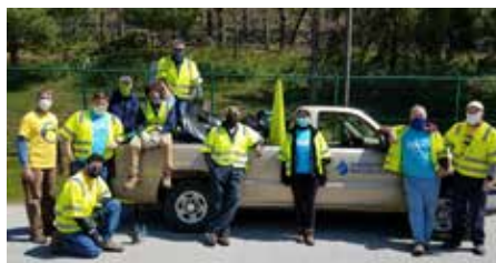
Employees from AQUA assist with the Brandywine Clean Up.

Though we wish there was no longer a need for an annual litter clean up, we know that we made a difference keeping trash off our roadways and ultimately out of our streams. As we are now learning, litter from plastics not only stays in our environment for decades, it breaks down into microscopic particles that are found in nearly every waterway and ocean across the planet.