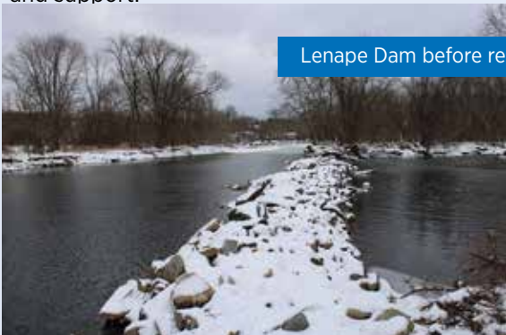
Lenape Dam before removal

This project was funded by the Lenape Cabin Club and a grant from the National Fish and Wildlife Foundation with funding from the U.S. Fish and Wildlife Service. Brandywine Red Clay Alliance is the grant recipient and provided in-kind project administration and support.