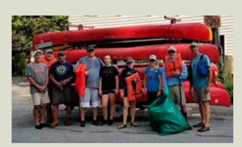
Volunteers from Victory Brewing at Brandywine Creek Clean-up

Engaging and facilitating municipal, county, and state organizations in DE and PA for watershed improvement along with our conservation partners continues with leadership roles in Christina Watersheds Municipal Partnership (Chester Co.) and Christina Basin Task Force (bi-state) with over 200 participants attending eight meetings and workshops. BRC also presented two workshops to 20 homeowners on how to address residential stormwater issues and visited 14 residential properties.