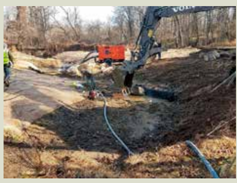
Stream bank grading on Plum Run Phase 1, December 2019

Restoration on Plum Run Watershed continued to be a focus for BRC with final designs and permits secured for 4,400 feet of impaired stream from Tigue Farm to the former Strode's Mill. Construction on Phase 1 was completed in December, with Phase 2 and 3 planned for 2020. A DCED grant also funded stream monitoring at eight sites on Plum Run to add to baseline data to measure water quality improvements in future years.