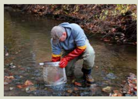
USGS Water Quality sampling at Red Clay Creek

• BRC continued work on the East Branch Red Clay Creek with restoration on 4,000 feet of impaired stream at Anson B. Nixon Park in Kennett Township and Borough of Kennett Square. Final designs and permits were secured, and funding awarded for Phase 1 of the project with restoration to be completed in 2020. A stream restoration plan on 1,850 feet of Bucktoe Creek in New Garden Township was completed and we are seeking funding for implementation in 2020/21. BRC worked with USGS and Chester County Water Resources Authority on continued water sampling at six sites in the Red Clay Watershed in PA.