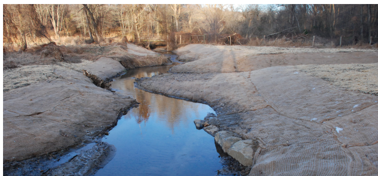
Recently restored banks of Plum Run after steep banks have been graded back

The restoration work will include re-grading the steeply eroding banks, stabilizing the banks with rock and wooden structures, and reducing erosion with buried root wads from downed trees. East Bradford Township is partnering with BRC and Stroud Water Research to plant over nine acres of new trees along the restored stream to help stabilize the banks and provide shade, leaves, and wood debris in the stream for aquatic life.