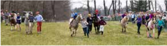
Leadline Pony Race