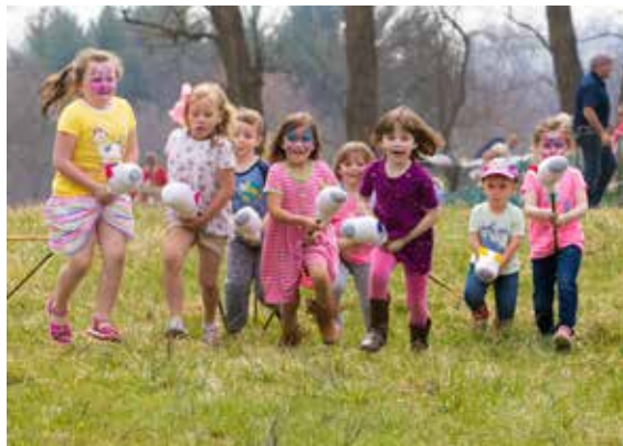
Stick Pony Race