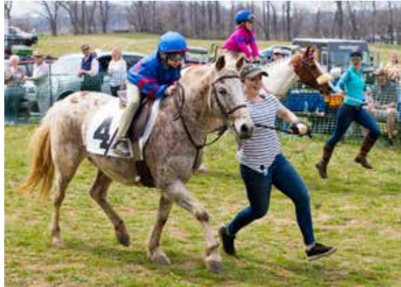
Leadline Pony Race