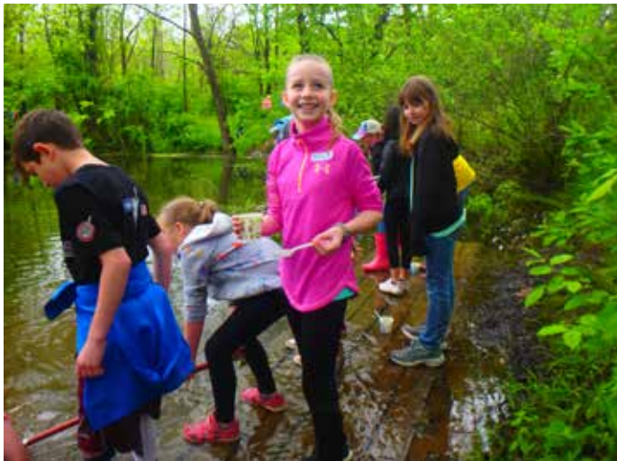
All smiles! Parents have commented that programs like our pond studies turn one-dimensional concepts into three-dimensional learning.

School outside? Students are always surprised when we welcome them for the day with this statement. While outdoor education is a valued practice, it is not always practical for classroom teachers to easily incorporate into their daily learning schedule. That is where our education programs come in! Our education staff works with schools to provide onsite programming at our Myrick Conservation Center or outreach or at their school or other nearby location. Our small grouping activities offer engaging and hands-on applications that align with classroom concepts in a multisensory and meaningful manner. Spring is an ideal time to bring the classroom outside for BRC education programs!