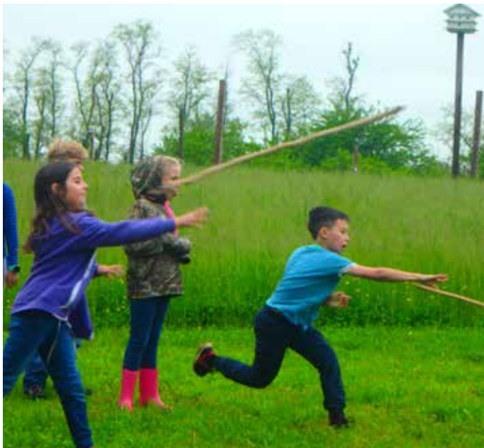
Learning through movement gets students out of chairs and actively engaged!