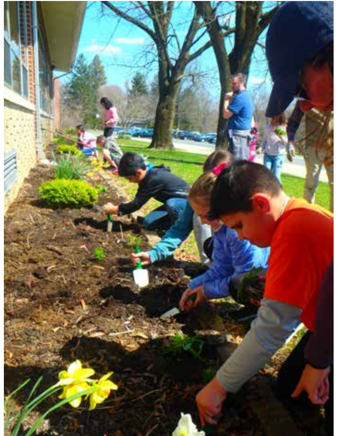
Improving water quality and supporting native pollinators... outreach watershed programs incorporate plantings that connect students with nature on their school grounds.