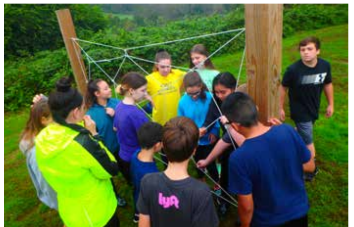
Successful lifelong learning skills include the ability to work with others on challenges both inside and outside of the classroom.