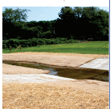
Stabilized stream crossing

Restoration Design: Clauser Environmental LLC