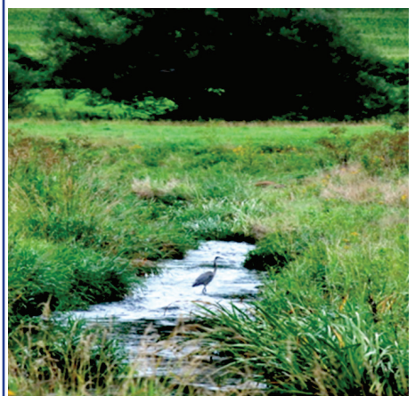
Little Buck Run after restoration

This restoration was two projects that, in total, restored over one mile of Little Buck Run in Parkesburg Borough and Sadsbury Township. The first project was completed in September 2014 with a tree and shrub buffer planted in November 2014. The stream as it appears today is immediately to the left.